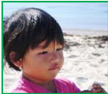
A day at the beach