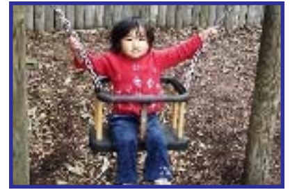
Enjoying a fall day