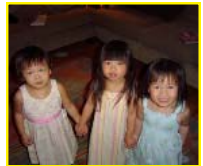
With Friends 2005