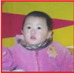
Foster care picture

I don't know where to begin to thank the whole Hunan Foster Care Program or any foster care program.