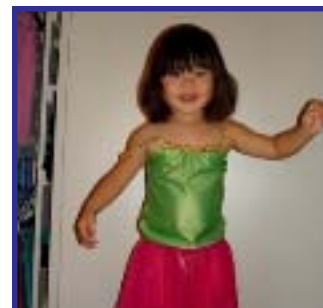
All dressed up