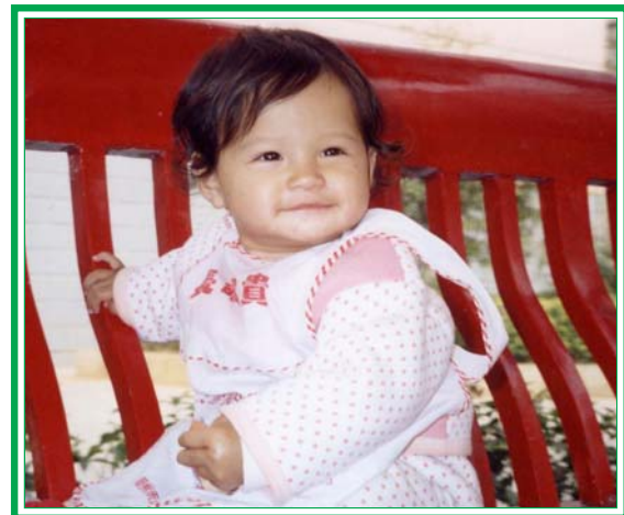
A mischievous look